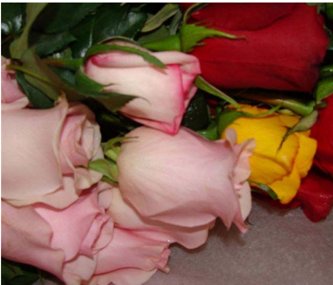
All the pretty women received roses (yes, we're all pretty)